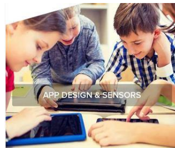
APP DESIGN & SENSORS