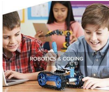
ROBOTICS & CODING