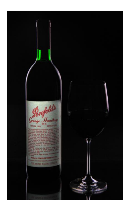
Search Langton's Fine Wine for Australian wines

3. Australia has more than 60 wine regions across the country and a good bottle of wine is sure to be a welcome gift. Langton's is an excellent guide to find some of the best drops in Oz. You can either order online or buy the ones you like from your local bottle shop. You need to be 18 years or older to purchase and consume alcohol in Australia. Limits apply when transporting alcohol on flights.