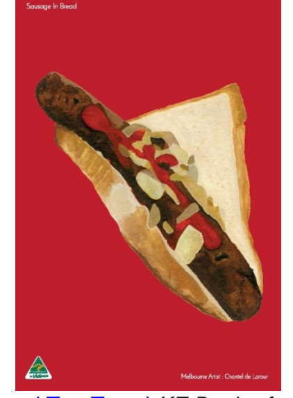
Sausage in Bread Tea Towel KE Design from $24.99AUD

2. Drying the dishes isn't a fun job but at least there's something awesome to look at if you're using a tea towel like this. The simple sausage on bread is a symbol of Aussie culture. If you haven't been to the local Bunnings hardware store for a sausage sizzle – you must go. It would be unAustralian not to.