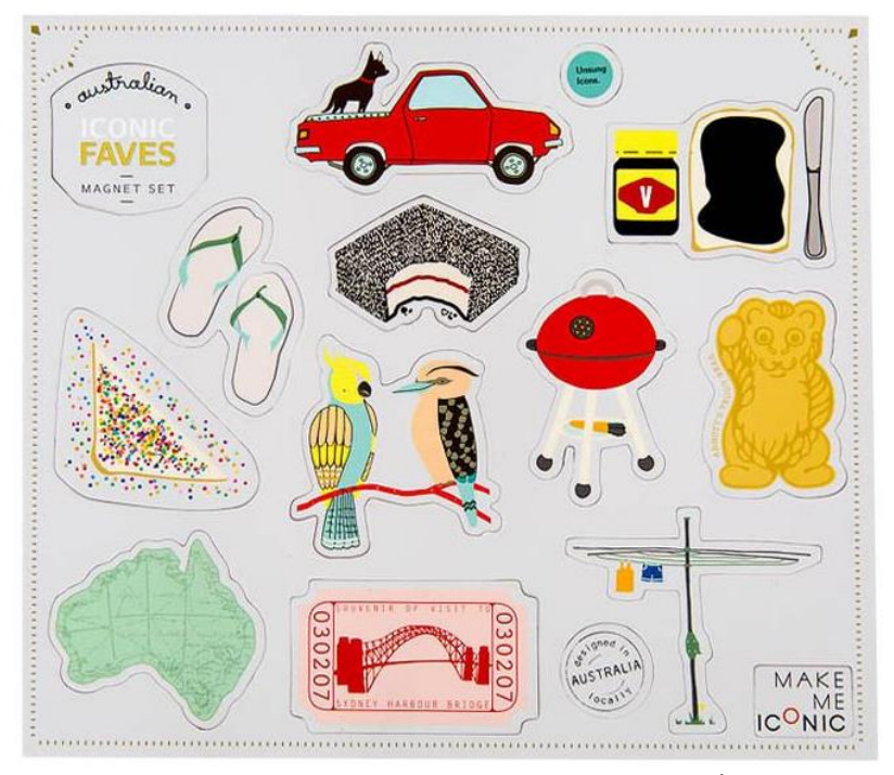
<u>Iconic Magnets – Faves</u> Make Me Iconic from $19.99AUD

1. A cheap and cheerful selection of magnets showing off some Australia's favourite icons including a lamington, fairy bread, hills hoist and a pair of thongs (also known as pluggers or flip flops). Useful and easy to pack in your luggage.