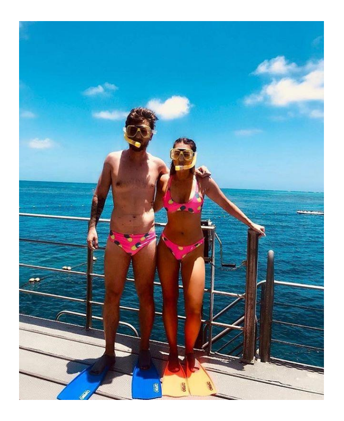
Mens and Womens Bathing Suits Budgy Smuggler from $50AUD

Product prices and availability are accurate as of the date/time of publishing and are subject to change.