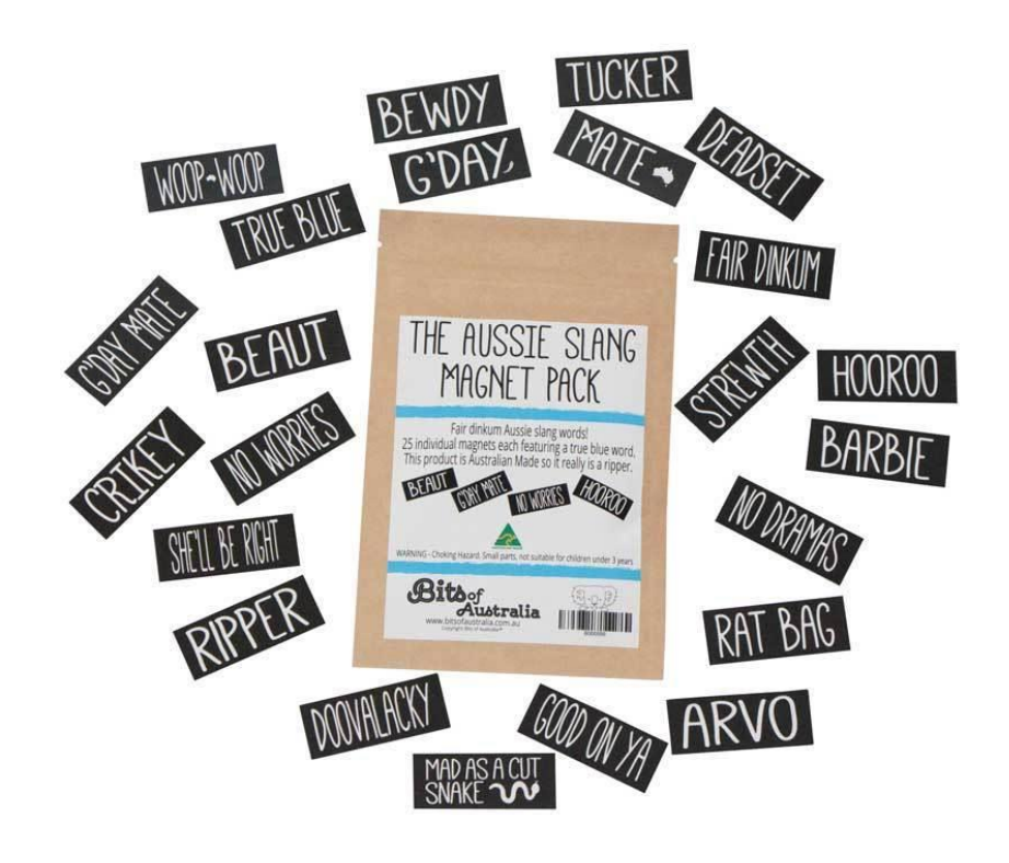
The Aussie Slang Magnet Pack Bits of Australia from $8.95AUD

7. Giving someone a selection of iconic Australian foods will help them get a real taste for what the Land Down Under has to offer. You can either send a ready-made gift box like these or head to your local supermarket and pick up some goodies to share. We recommend Vegemite, Tim Tams, Caramello Koalas, Fantales, Arnott's Barbecue Shapes, Twisties, some honey and even macadamia nuts.