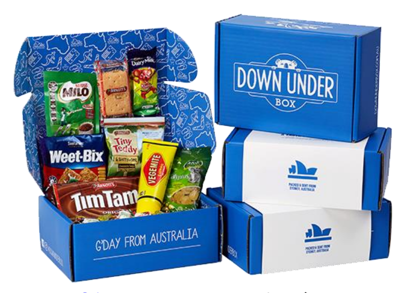
Aussie Gift Box Down Under Box from $50.00AUD

7. Giving someone a selection of iconic Australian foods will help them get a real taste for what the Land Down Under has to offer. You can either send a ready-made gift box like these or head to your local supermarket and pick up some goodies to share. We recommend Vegemite, Tim Tams, Caramello Koalas, Fantales, Arnott's Barbecue Shapes, Twisties, some honey and even macadamia nuts.