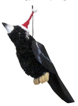
Australian Decorations Christmas Elves from $7.95AUD

9. Ornaments are small, cute and can really capture the Australiana vibe in a festive way. You can go for something familiar to hang on your Christmas tree like a koala or kangaroo, or pick a decoration that's a bit more unusual like a magpie or penguin.