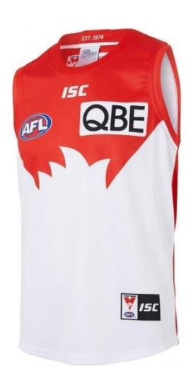
Sports Merchandise Fangear.com Prices vary

9. Ornaments are small, cute and can really capture the Australiana vibe in a festive way. You can go for something familiar to hang on your Christmas tree like a koala or kangaroo, or pick a decoration that's a bit more unusual like a magpie or penguin.