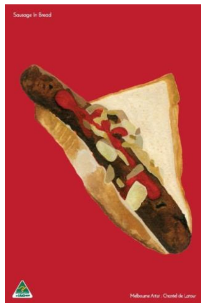
Sausage in Bread Tea Towel KE Design from $24.99AUD

2. Drying the dishes isn't a fun job but at least there's something awesome to look at if you're using a tea towel like this. The simple sausage on bread is a symbol of Aussie culture. If you haven't been to the local Bunnings hardware store for a sausage sizzle – you must go. It would be unAustralian not to.