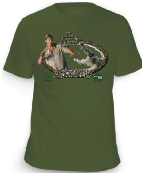
Crikey T-shirt Australia Zoo from $29.95AUD

5. Crikey, check this out! Steve Irwin is an Aussie legend whose crazy antics and love for wildlife conservation made him famous around the world. The Australia Zoo online store has everything from khaki Crocodile Hunter shirts to plush toy animals and drink coolers. You're sure to find a souvenir with character.