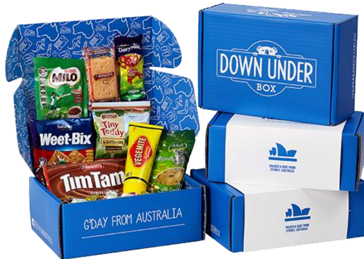
Aussie Gift Box Down Under Box from $50.00AUD

8. Footy. Cricket. Netball. Have you become a sports fan since coming to Australia? Wear your team colours and take home a legit souvenir from your time in Oz. Grab a jersey or go casual with a t-shirt, cap or hoodie.