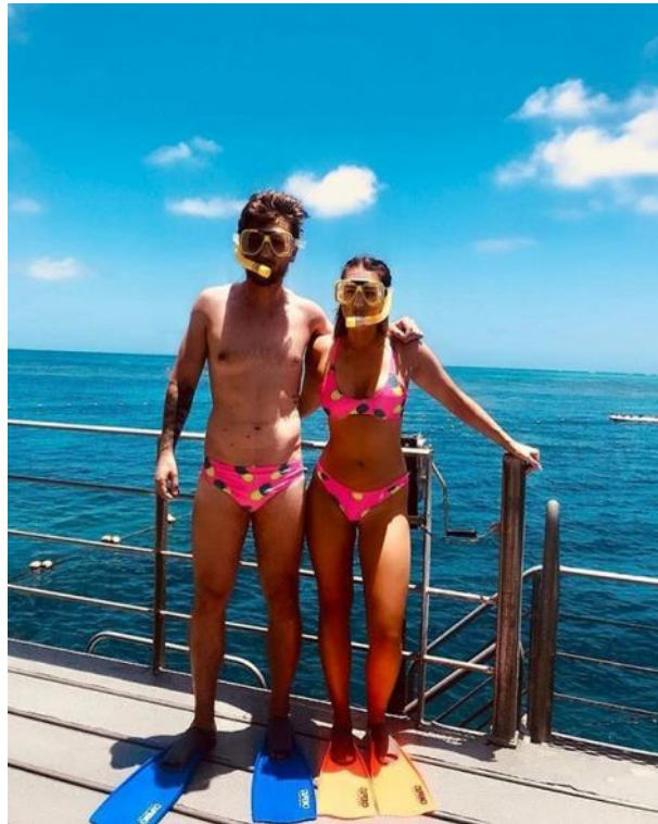
Mens and Womens Bathing Suits Budgy Smuggler from $50AUD

10. With our sunny climate and beautiful beaches, it's not unusual to spend a lot of your time wearing a swimsuit. The term " budgie smugglers " is an Australian phrase you may have come to know and this range of locally-made swimwear really shows off what the Aussie lifestyle is all about.