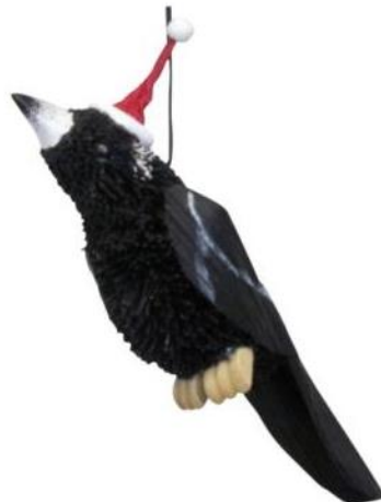
Australian Decorations Christmas Elves from $7.95AUD

9. Ornaments are small, cute and can really capture the Australiana vibe in a festive way. You can go for something familiar to hang on your Christmas tree like a koala or kangaroo, or pick a decoration that's a bit more unusual like a magpie or penguin.