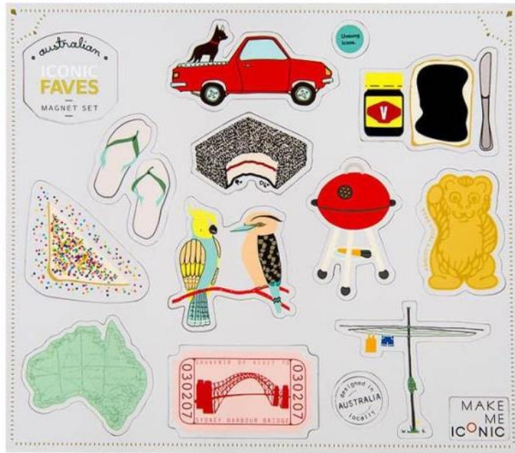
Iconic Magnets – Faves Make Me Iconic from $19.99AUD

1. A cheap and cheerful selection of magnets showing off some Australia's favourite icons including a lamington, fairy bread, hills hoist and a pair of thongs (also known as pluggers or flip flops). Useful and easy to pack in your luggage.