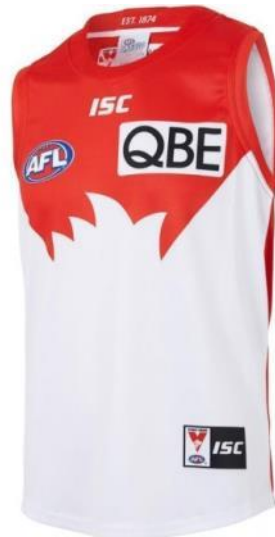
Sports Merchandise Fangear.com Prices vary

8. Footy. Cricket. Netball. Have you become a sports fan since coming to Australia? Wear your team colours and take home a legit souvenir from your time in Oz. Grab a jersey or go casual with a t-shirt, cap or hoodie.