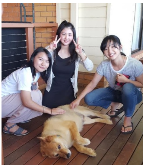
Our Southern Cross University students from Lismore are pretty chuffed with the new member of their family!